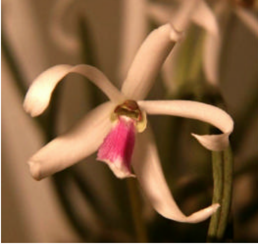
Leptotes bicolor Grown by Suzanne Wilcox

This month we had a very good collection of species to discuss with some very rare (for South Australia) species brought by our new member Dennis Trevorrow we hope to see a lot more of Dennis' plants in the future