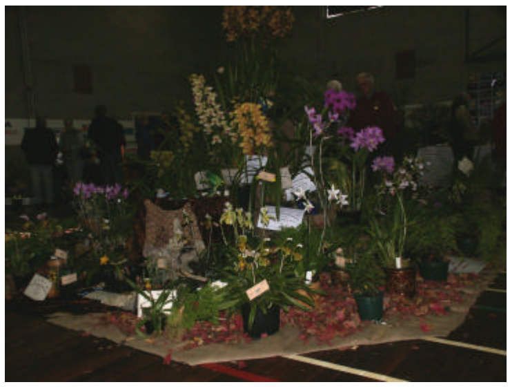
Club Display At the SAROC Fair

10 December 2002 Main & Species Groups combined12 Dec 2002 Daytime Group