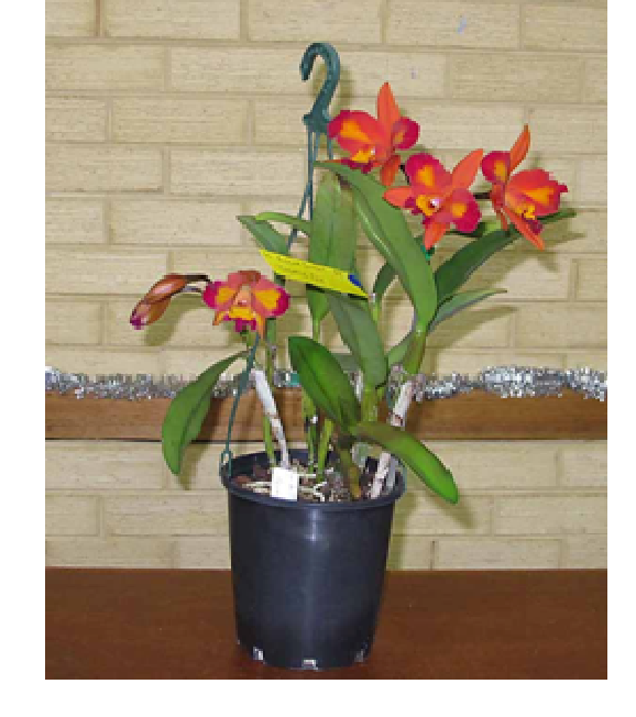
Flower of the Day