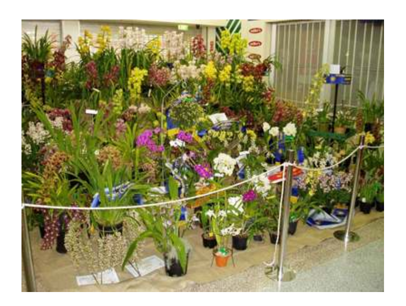
The Spring Show Display at the Arndale Shopping Centre