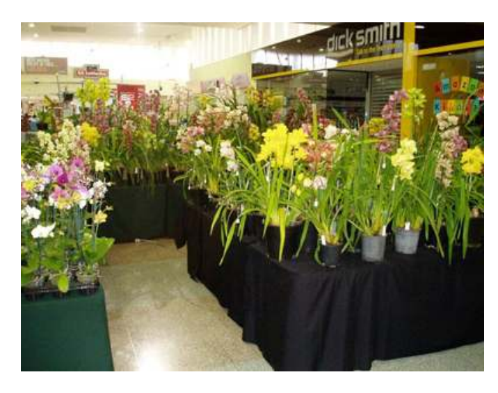
The Spring Show Trading Table at the Arndale Shopping Centre