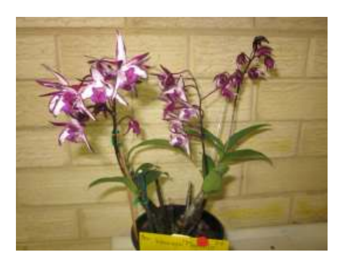
Popular vote plant Den. Warrugal 'Magenta' benched by Eileen Pinnock